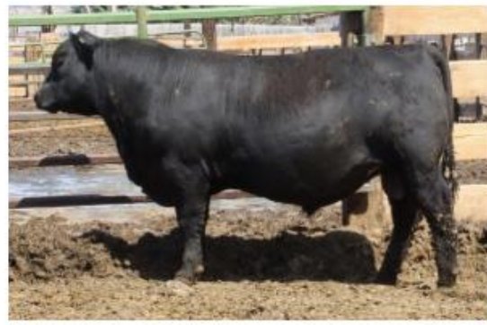
Brumfield Resilient 4351 (20929467)