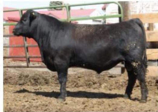
Brumfield Commerce 4312 (20997989)