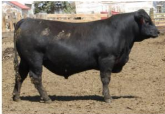
Brumfield Step Up 4332 (20997976)