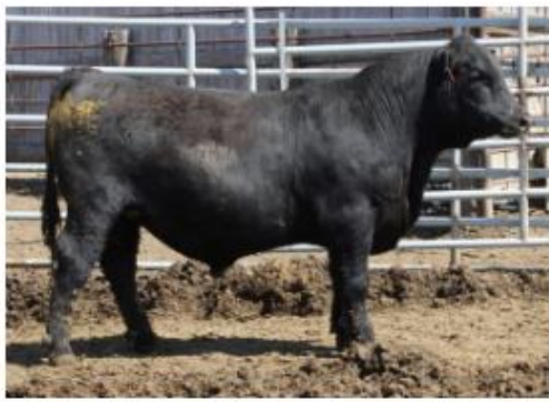
Brumfield Fireproof 4392 (21011421)